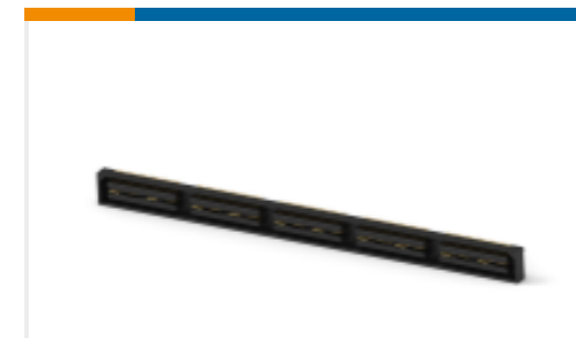
TE Part # 2-1658012-5 MSB0.80RC-ASY200FL,-,10,-TY