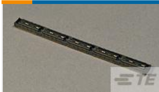
TE Part # 2-1658043-5 MSB0.80RC-ASY200FL,-,F,-TY