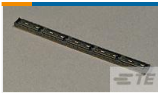
TE Part # 1658012-5 MSB0.80RC-ASY200FL,-,10,-TY