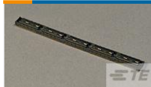
TE Part # 2-1658462-5 MSB0.80RC-ASY200FL,-,30,-TY