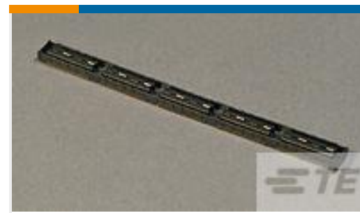
TE Part # 1658462-5 MSB0.80RC-ASY200FL,-,30,-TY