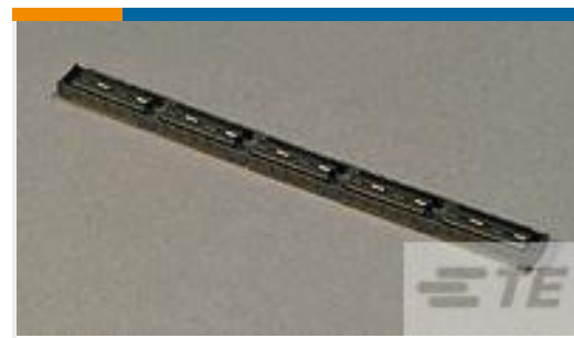
TE Part # 1658043-5 MSB0.80RC-ASY200FL,-,F,-TY